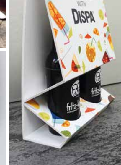
GET INSPIRED: WWW.DISPLAY. 3ACOMPOSITES.COM /INSPIRATION